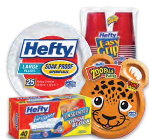
disposable tableware & waste bags